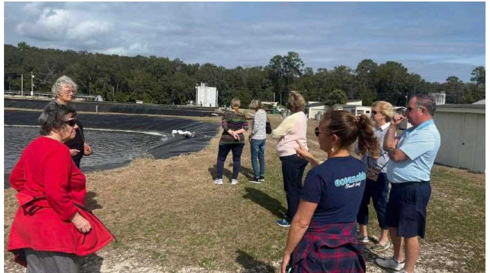
NautiLadies tour of Waddell Mariculture Center