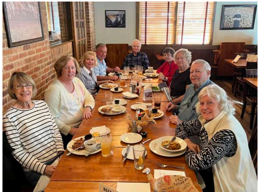
Lunch after the tour