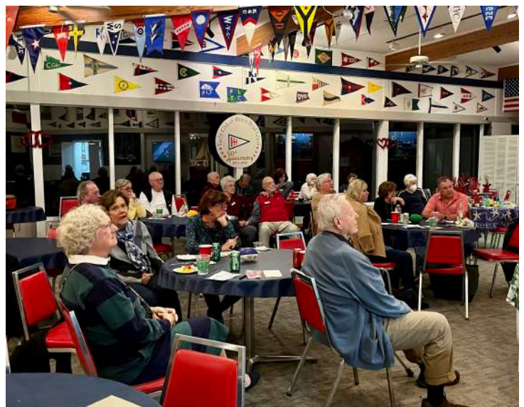
Super Bowl Party