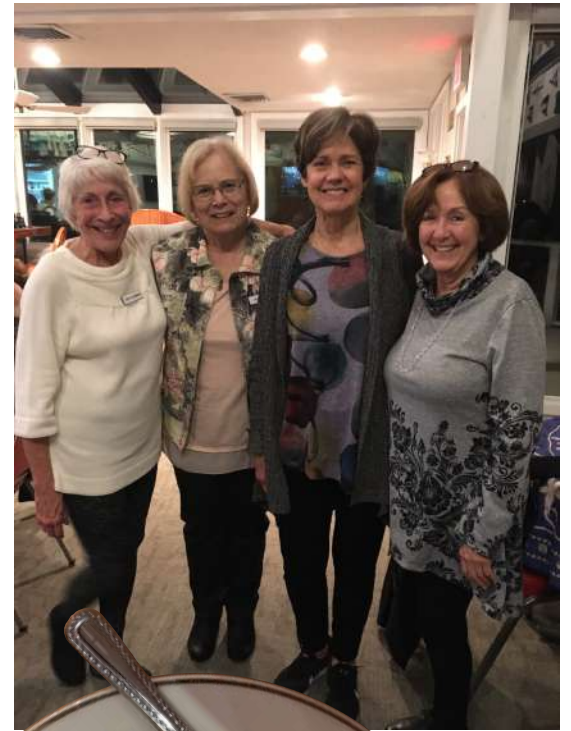
Friday Night Special Dinner with guests from Moss Creek