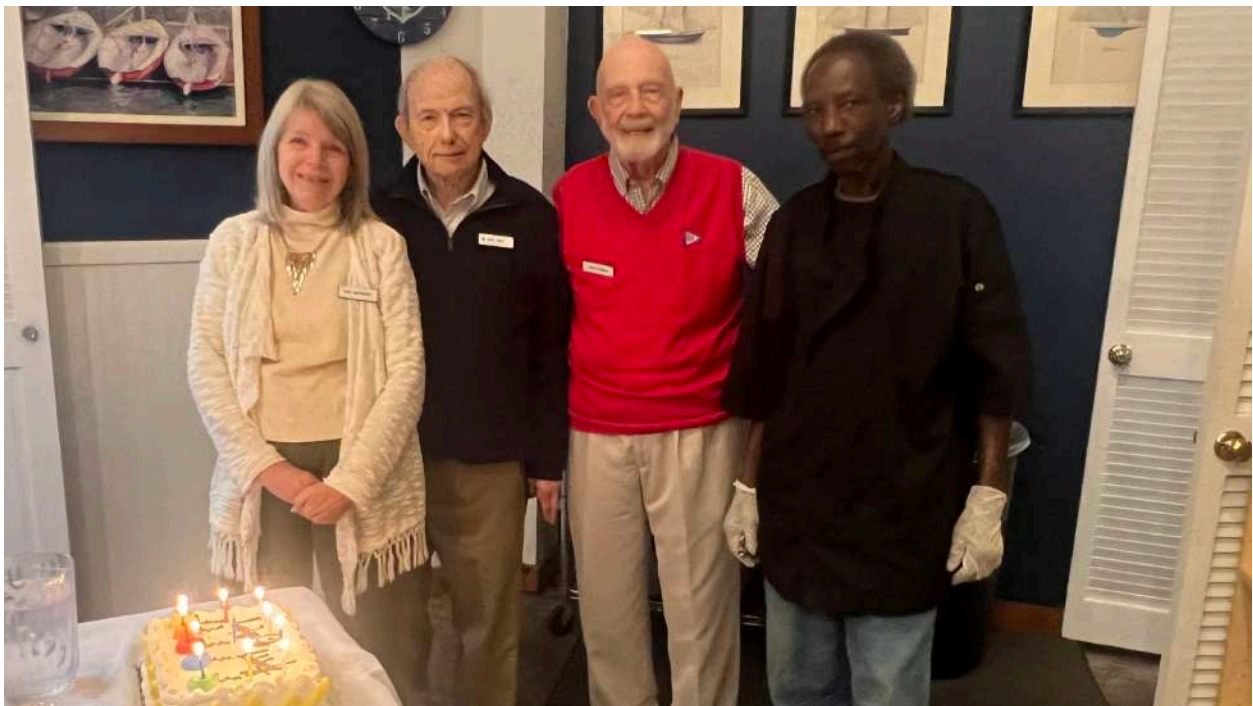
January Birthday Night

PROOFREADER: Work with The Main Sheet editor. Must have Apple products including Pages and be able to work on short timeline at the end of the month.