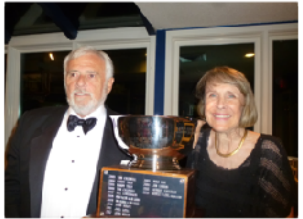
Crew of Roebot to Cuba